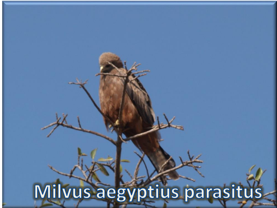
Milvus aegyptius parasitus