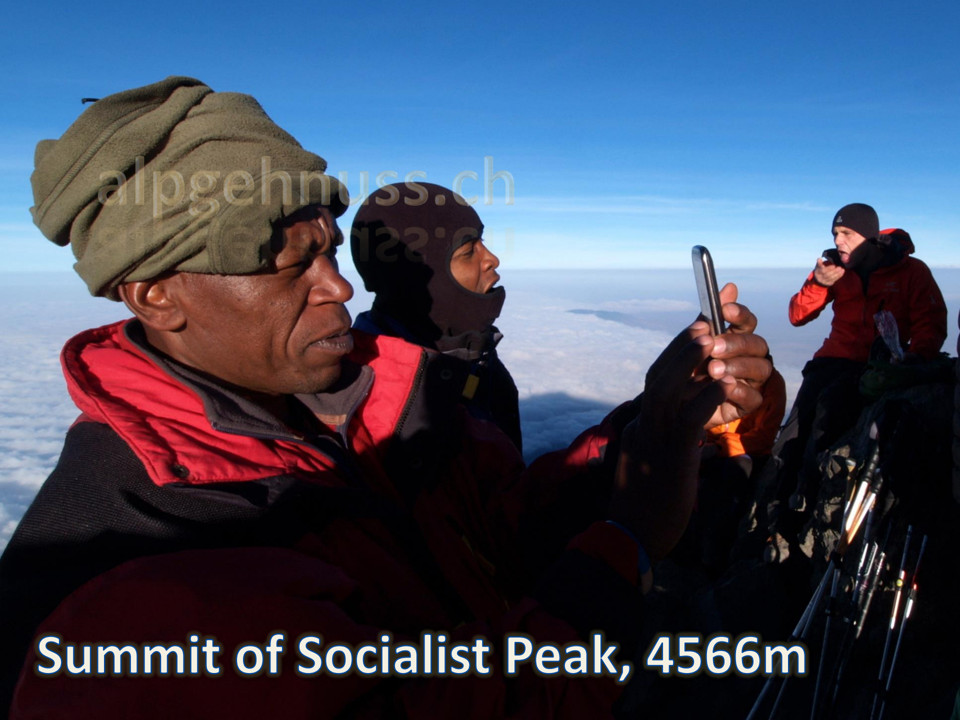
Summit of Socialist Peak, 4566m